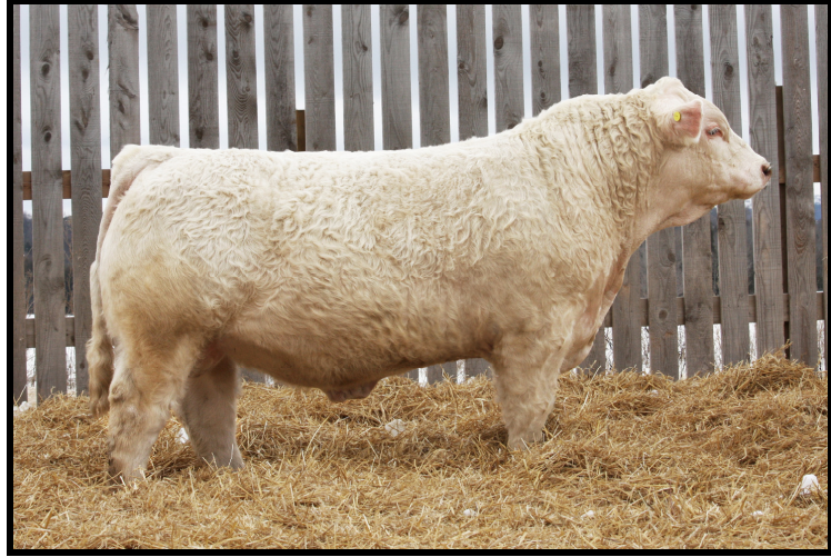
Lot 29 AGA DALE 2D