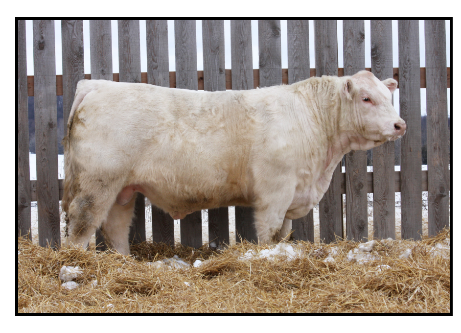
Lot 24 CEDARDALE DOWNTOWN 90D