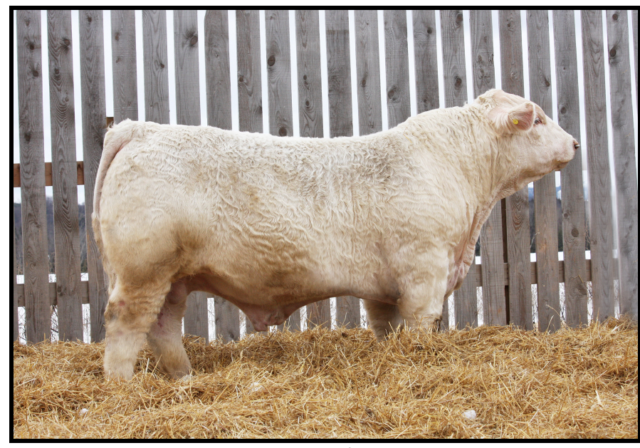
Lot 2 CEDARDALE DOMINANCE 5D