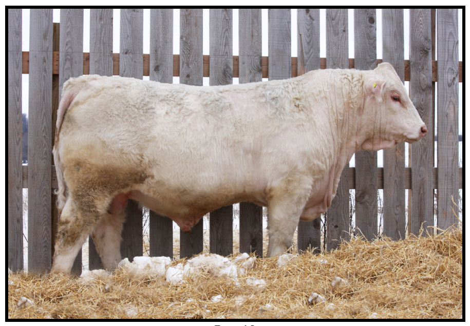
Lot 10 CEDARDALE DALLAS 35D