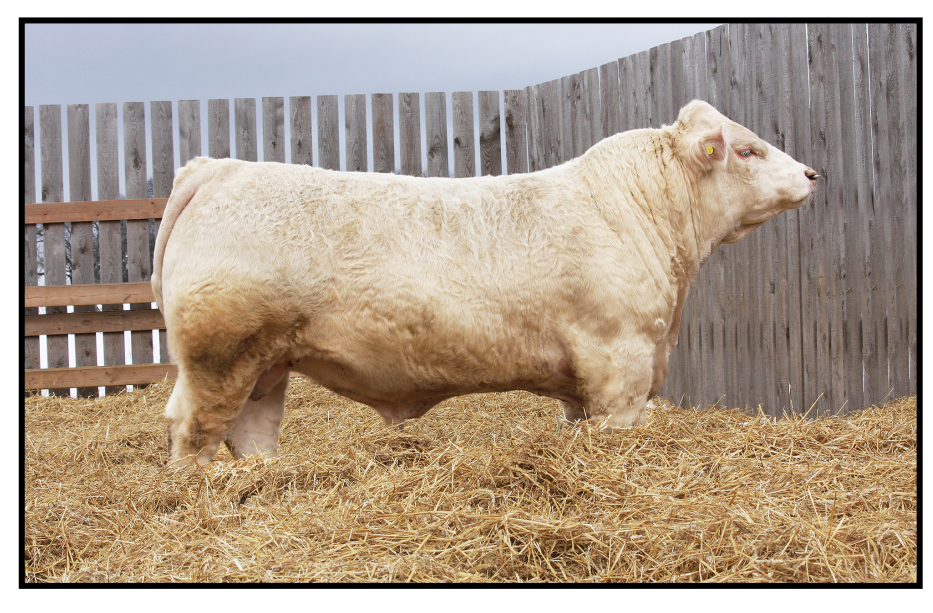
Lot 28 CEDARDALE DISCOVERY 103D