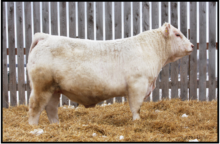
Lot 30 CEDARDALE DUKE 111D