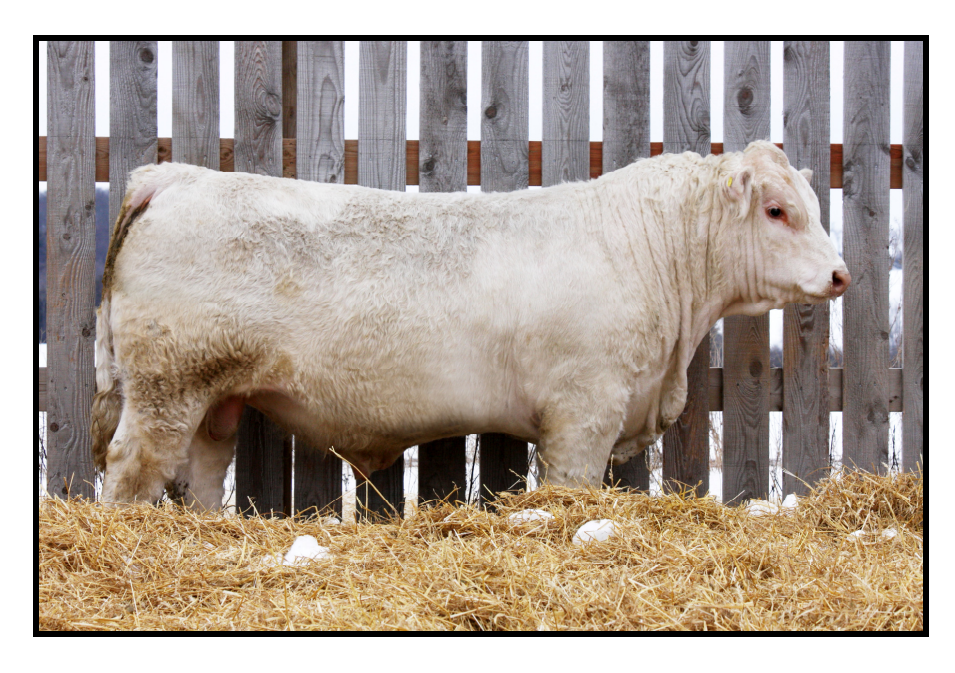
Lot 5 CEDARDALE DURHAM 14D