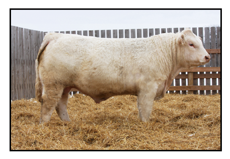
Lot 1 CEDARDALE DELTA 4D